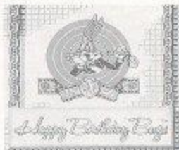
Carrot Symbol A Contraption

If you are caught by one of the contraptions, you will be stunned for a short time. While stunned, you cannot use the hammer. If you are caught twelve times, you will lose a life. The status of your current life is indicated by three hearts in the upper left corner of the screen. Each heart starts out red, turns white, then black and then clear when you are caught by one of the characters or contraptions.